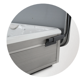
Covers and Lifters